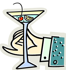
Mystery of the Nile

Martinis and IMAX, Friday evenings, 5:30-10:00 PM