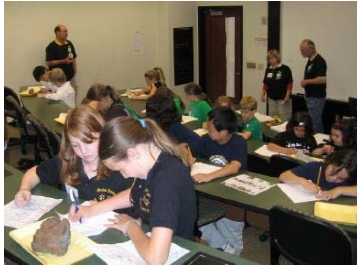
Pictures of the Elementary School Science Olympiad at Kennesaw State University