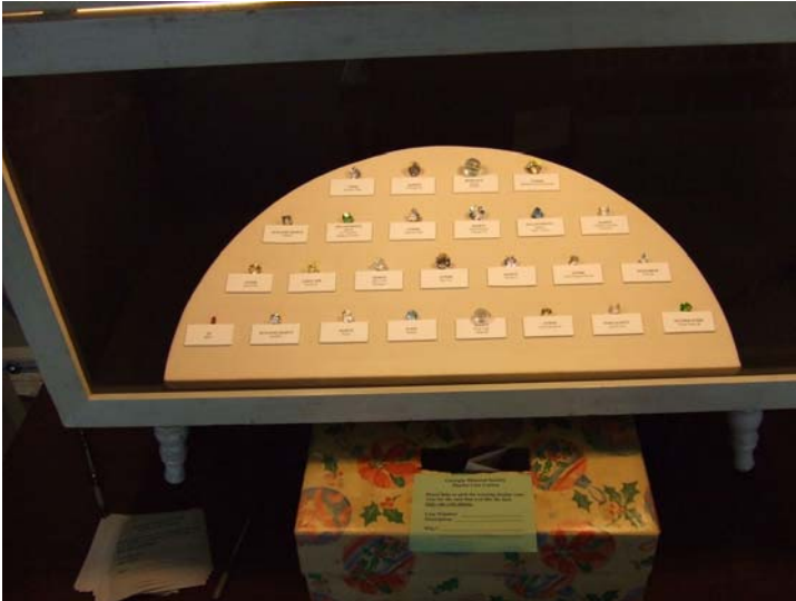
Exhibit Contest Winners (top to bottom)