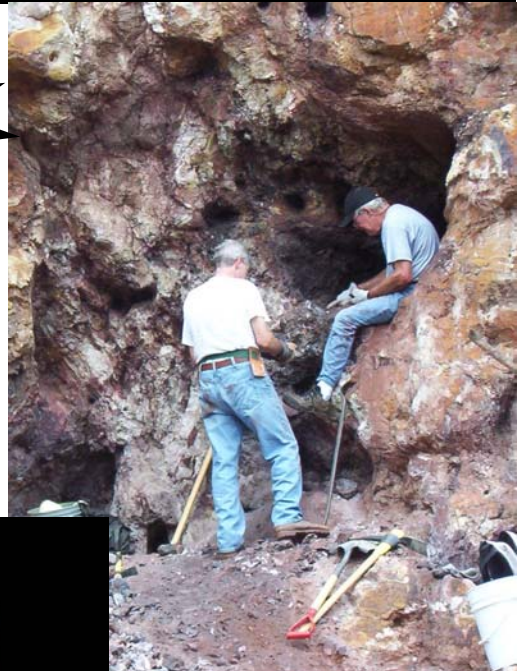
Clockwise from Top Right